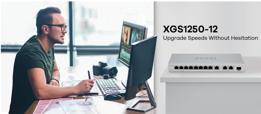
XGS1250-12 Upgrade Speeds Without Hesitation

Efficient Energy saving with green Ethernet features